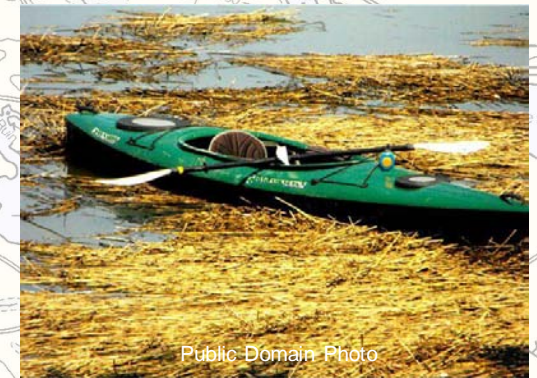
Public Domain Photo