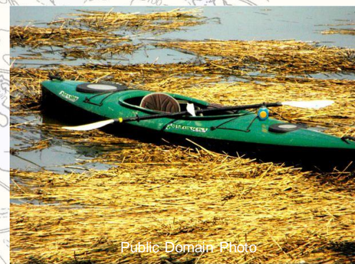
Public Domain Photo